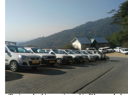
Taxis parked in a taxi stand in Dharamshala.

"The day I was about to hire a taxi to Indrunag, the taxi driver pitched a price of 300 Rupees. I was totally, shocked," says Umang Arora who hails from Jalandhar, but presently