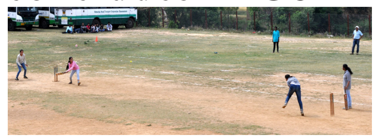
A Women's Cricket match in progress during the Annual Sports Meet in CUHP