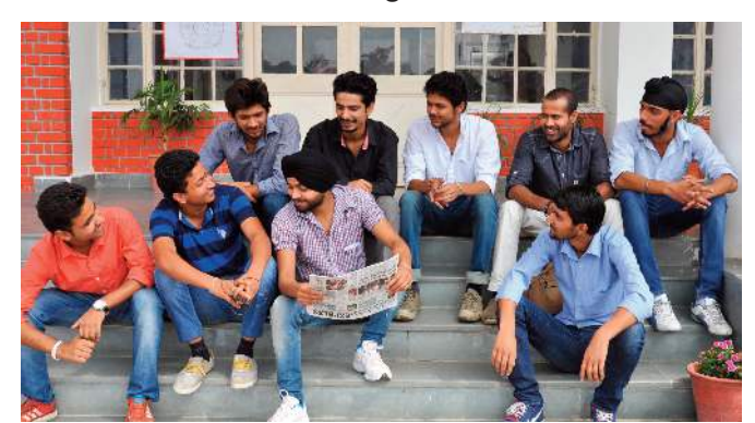
Students from across the country comes together in-CUHP campus.

include some words in her conversation with student, couldn't believe her when she heard, Teacher – "You have to submit your assignment Rajasthani accent, which creates an environ- "Ji Shukriya", when she passed the attendance