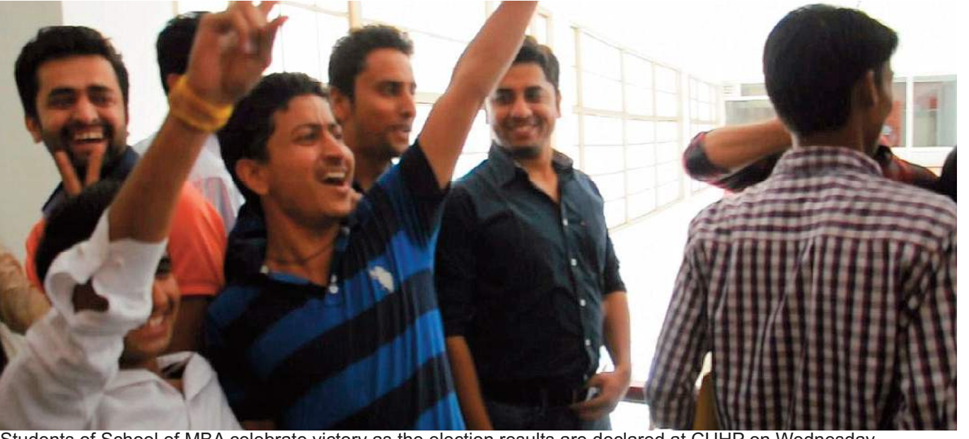
Students of School of MBA celebrate victory as the election results are declared at CUHP on Wednesday.

With the election results declared, student council has got 20 elected members. The remaining 20 members, who are nominated based on academic performance, will be shortly selected.