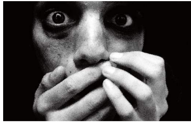
For representation only

What is widely considered as a man's prized possessions in our hu'man' society- land,